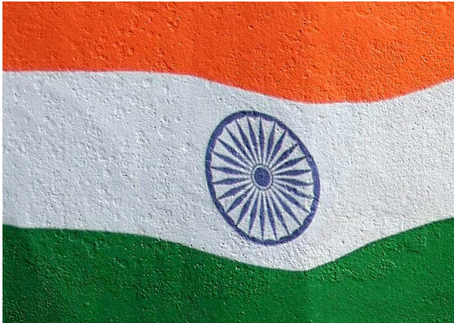
India's flag

This information is taken from http://www.languageshome.com/English-Telugu.htm and http://www.languageshome.com/English-Hindi.htm .